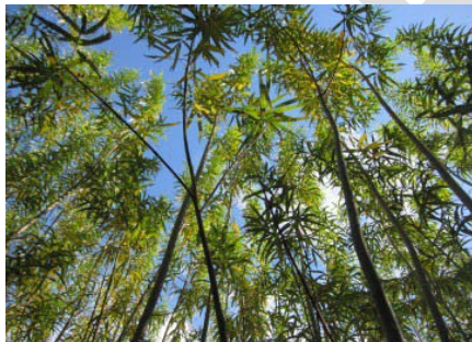
Three-year old willow ( Salix schwerinii x S. viminalis ) Plantation for biomass production in French Ardennes